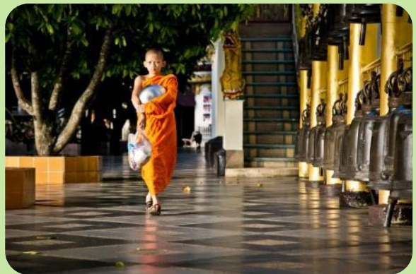
Wat Doi Suthep temple