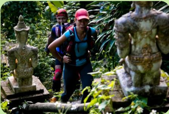
Wat Palaad temple